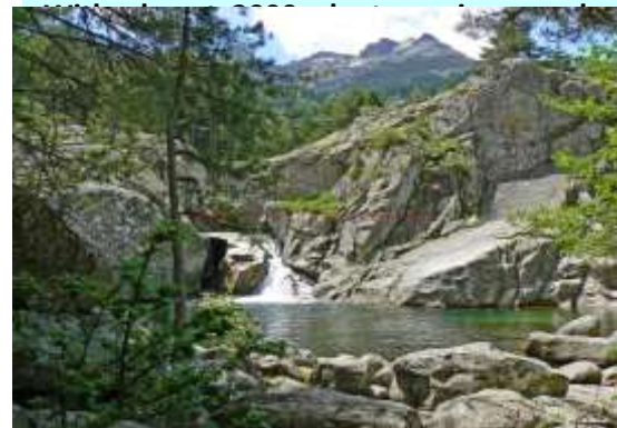
Gorges de Tavignano

Inland, the Regional natural park of Corsica is a rich place for fauna and especially birds who find a lot of shelters in the cliffs. An observatory has been put in place to protect the mand make their inventory.