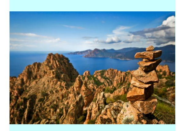
Massif du Rotondo

Passionate about the wild life, he will share his knowledge of the nature and the stories of the mountains with you. Since your security is essential to us, he can give you advice on technics and gear. He is constantly in direct link with local rescuers and carries a first aid kit in complement to the personal ones.